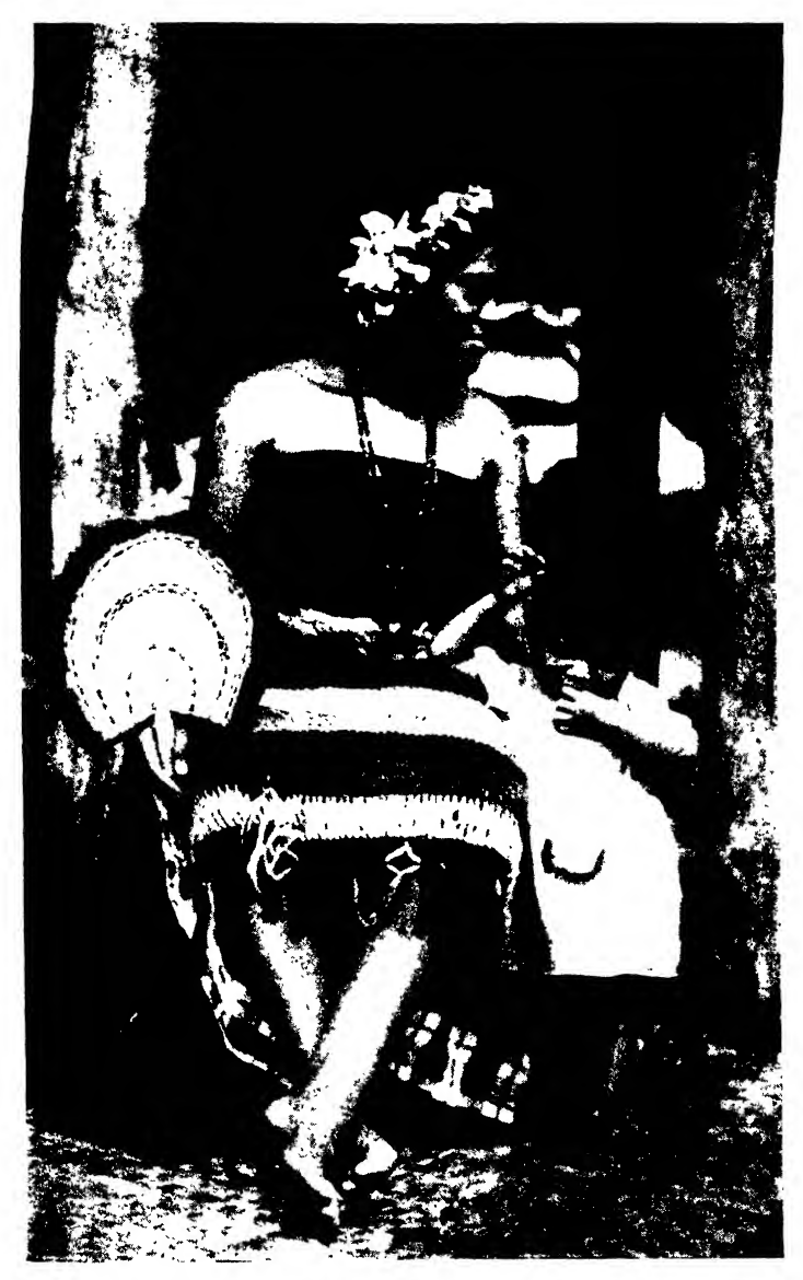
A chief's daughter and the baby of the household whose yellow hair will some day make a chief's headdress