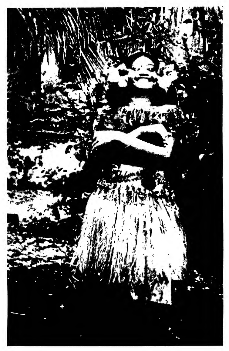
With Hibiscus in her hair