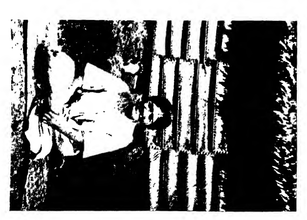
A famous maker of bark cloth