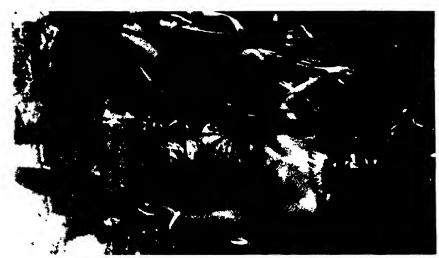
In the bark cloth costume of long ago