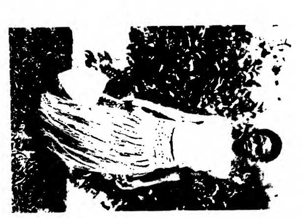
Dressed up in her big sister's dancing skirt